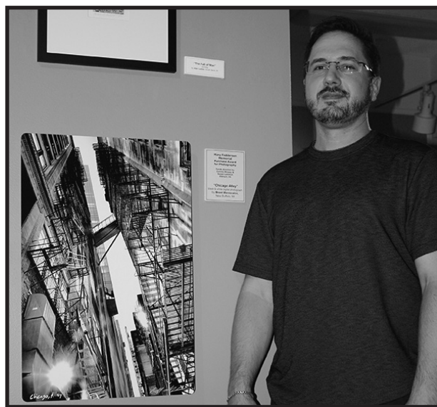
Mary Feddersen MEMORIAL AWARD for Photography