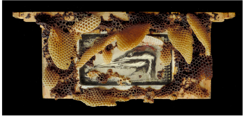
Pileated Head (Woodpecker) , etching with beeswax