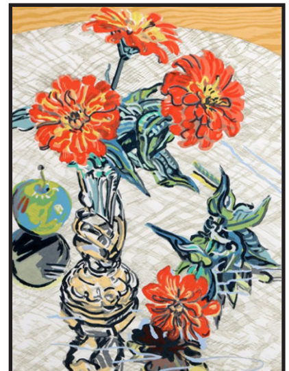
Still Life with Zinnias , 1995, silkscreen, ed. 49/65, by Janet Fish (b.1938- )

These exhibits are sponsored by DONORS from the American Circle of MMAA supporters.