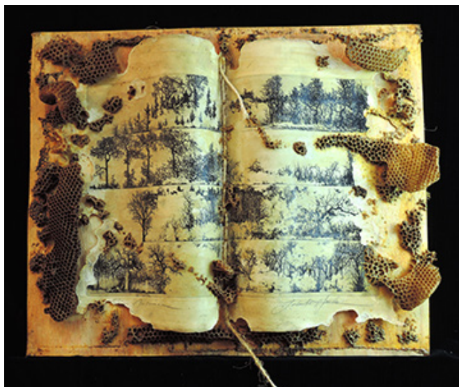
Fuga Autumna Ornamented by Honeybees 2017, Etching with aquatint and drypoint beeswax applied by bees in a living hive, 22 x 28 in.

"As we move through the pages of this scripture, we see the growth stages that woodlands undergo when they develop from fire-scarred openings and clear-cuts, slowly over decades and even centuries to become climax forest. Patterns repeat themselves, establishing rhythms that overlap with other rhythmic patterns, echoing the musical language of harmonics and counterpoint in a fugue-like textural concerto of deciduous forms – each species cleaving the heavens with its own familiar signature."