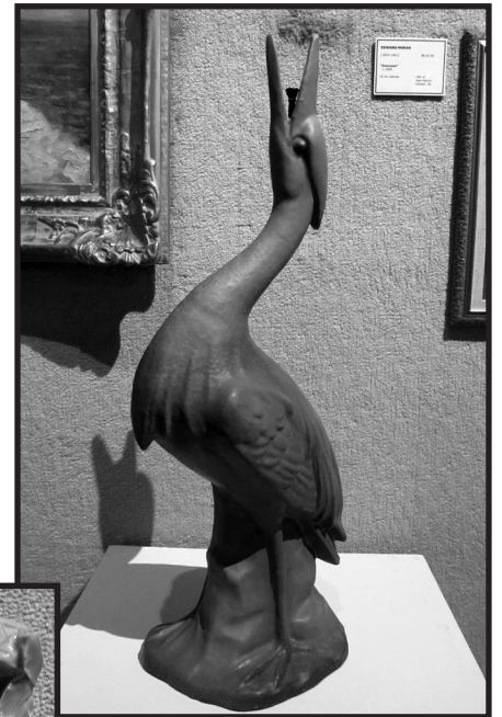
"Standing Heron Fountain" made by Weller Art Pottery Company, Ohio c.1920-30