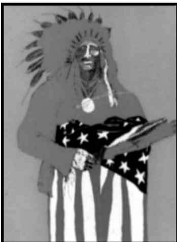
"Last Indian with American Flag", 1976, serigraph, ed. 146/150 by Fritz Scholder (1937-2005)

Visit the official website at MidwestMuseum.US