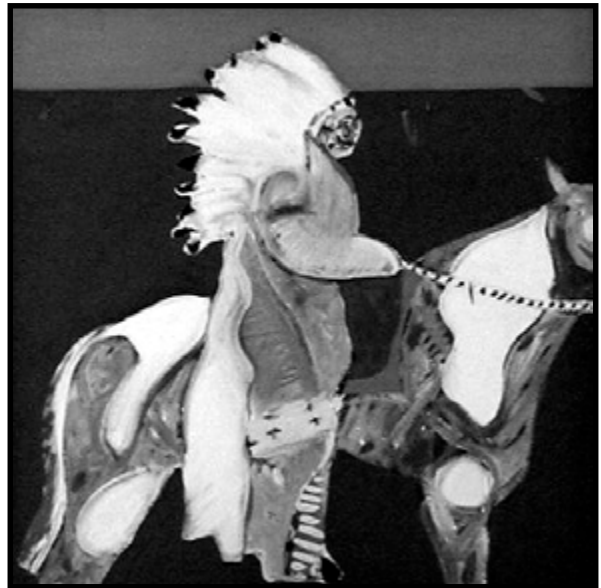
"Indian on Green Pinto", 1970, oil on canvas, by Fritz Scholder

FEES: $50./student for the week. Call 293-6660