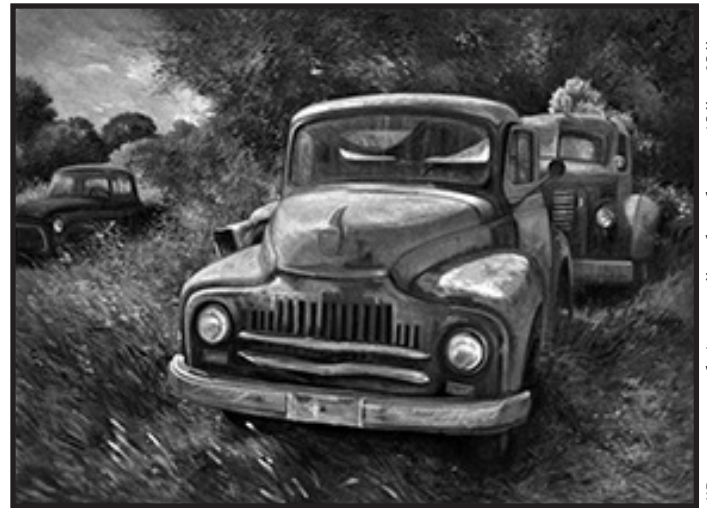
"International Autumn", oil on linen, 48" x 68"